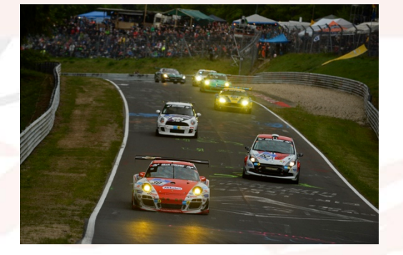
A treat for fans and drivers: The Frikadelli Porsche 911 GT3 R is a strong favourite for a top ten finish at the 24-hour race at the Nürburgring.