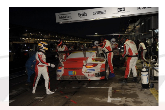
Flashback to 2015: Frikadelli Racing was leading the race with the predecessor of today's Porsche 911 GT3 R for quite a long time.