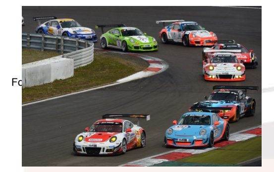
All set for a good result in the 24-hour race Nürburgring: the Frikadelli Porsche 911 GT3 R.