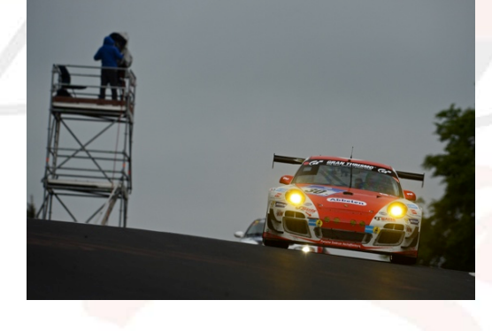
Mega live coverage: German TV stations RTL and RTL Nitro will broadcast more than 25 hours from this year's Eifel classic